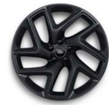
SV Bespoke 22" Style 5131 Satin Black with Gloss Black contrast