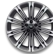
23" Style 1075 Diamond Turned with Gloss Dark Grey contrast