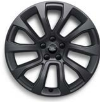
21" Style 5126 Satin Dark Grey Standard on Dynamic SE

With a variety of styles and finishes for 21", 22" and all-new 23" wheels to ensure robust proportions and supreme stature.