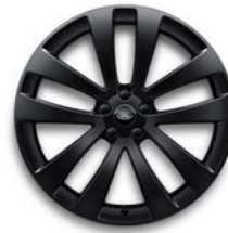
23" Style 5135 Gloss Black