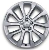
21" Style 5126