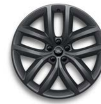
22" Style 5127 Satin Dark Grey Standard on Dynamic HSE