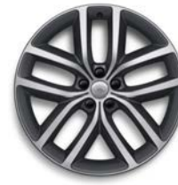
22" Style 5127 Diamond Turned with Satin Dark Grey contrast