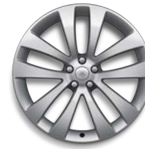
23" Style 5135 Standard on First Edition