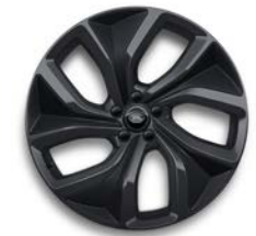
SV Bespoke 23" Style 5128 Dark Grey with Carbon inserts