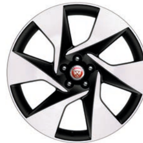
20" 6 SPOKE 'STYLE 6007'