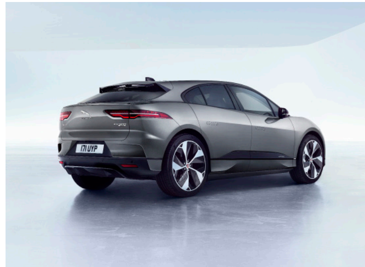
VEHICLE SHOWN: I-PACE in Eiger Grey with optional features