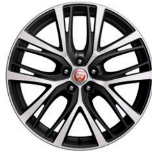
20" 5 SPLIT-SPOKE 'STYLE 5070'