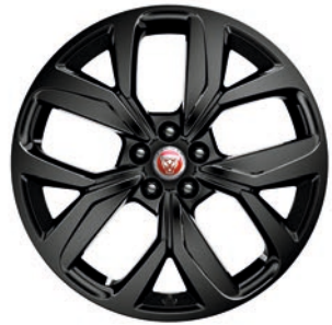
20" 5 SPOKE 'STYLE 5068'