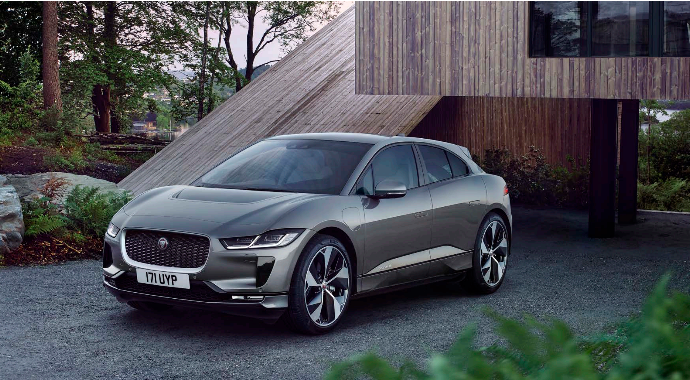
VEHICLE SHOWN: I-PACE in Eiger Grey with optional features