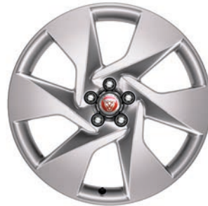
20" 6 SPOKE 'STYLE 6007' (Standard on SE)