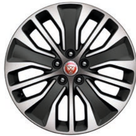
19" 5 SPLIT SPOKE 'STYLE 5055'