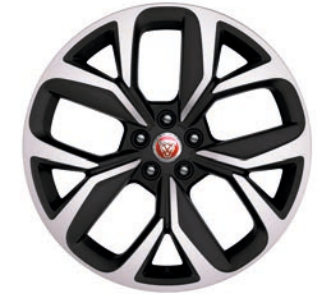
20" 5 SPOKE 'STYLE 5068' (Standard on HSE)