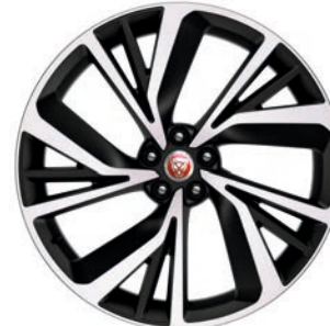
22" 5 SPLIT-SPOKE 'STYLE 5056'