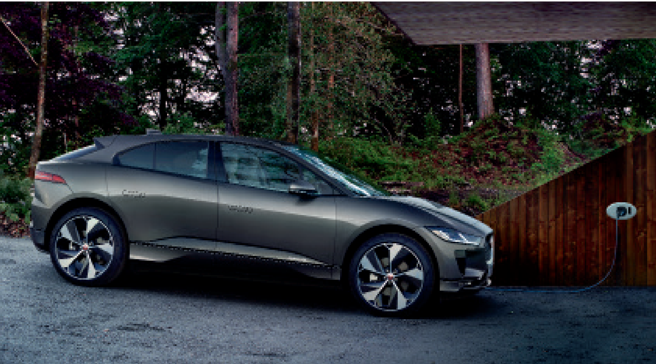
VEHICLE SHOWN: I-PACE in Eiger Grey with optional features