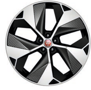
22" 5 SPOKE 'STYLE 5069'