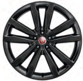
20" 5 SPLIT SPOKE 'STYLE 5051'