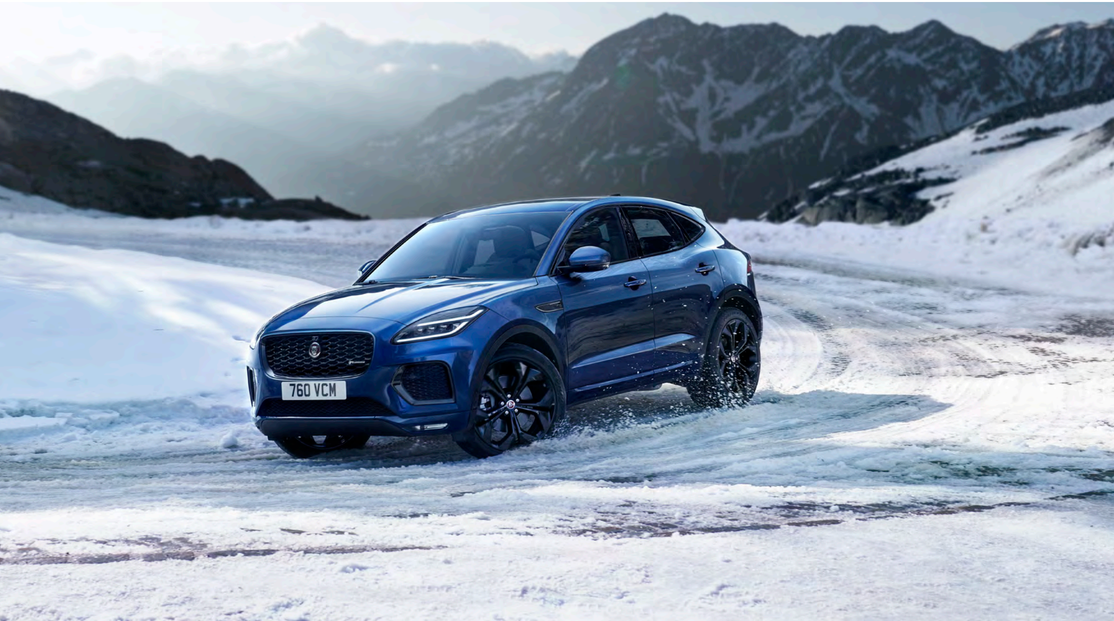
VEHICLE SHOWN: E-PACE R-Dynamic in Bluefire with optional features