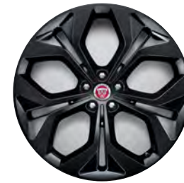
21" 5 SPLIT SPOKE 'STYLE 5053'