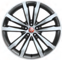
20" 5 SPLIT SPOKE 'STYLE 5051'