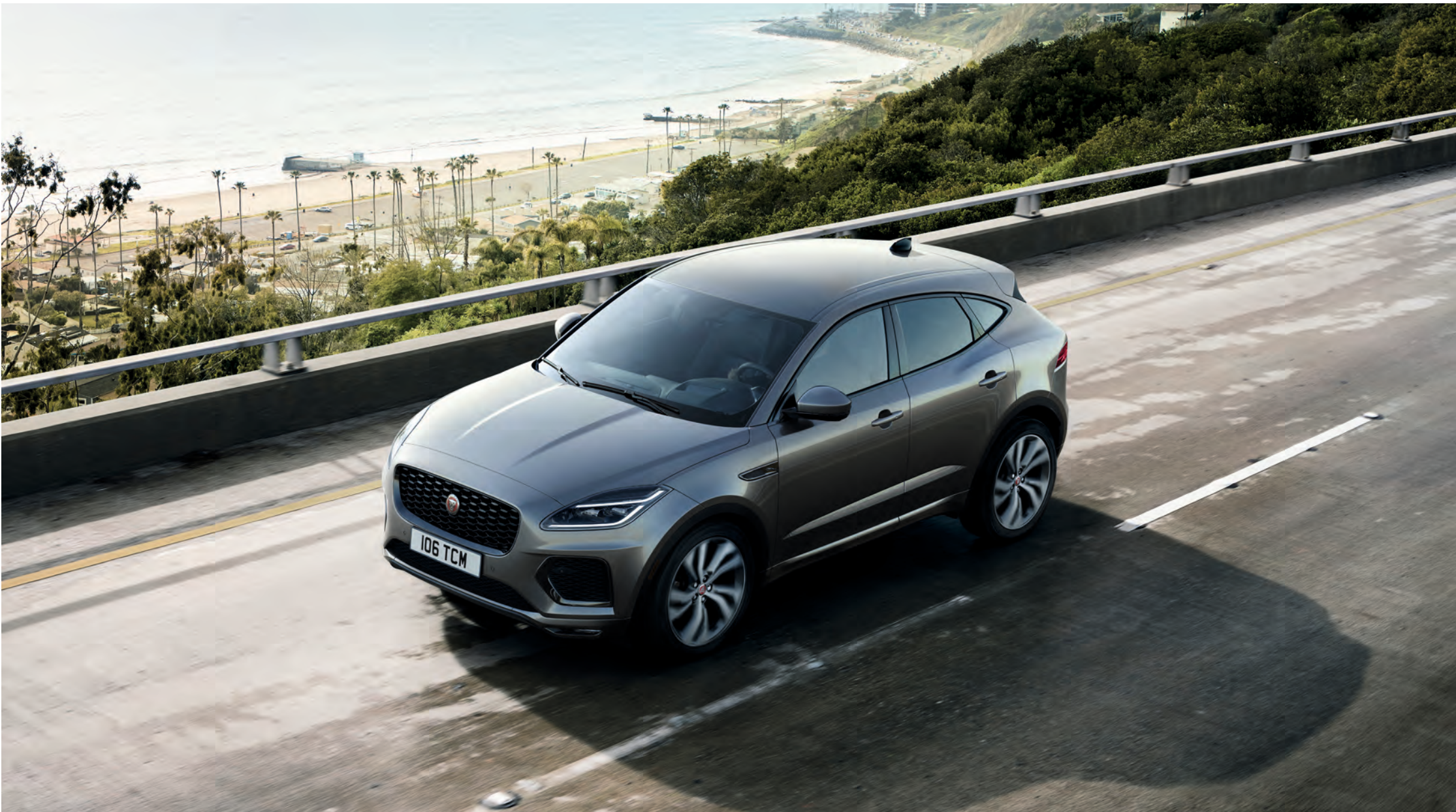
VEHICLE SHOWN: E-PACE R-Dynamic in Eiger Grey with optional features