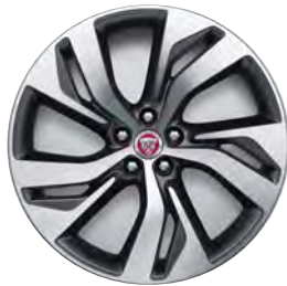
20" 5 SPLIT SPOKE 'STYLE 5120'