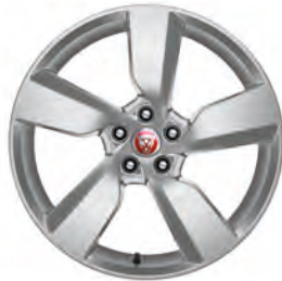
19" 5 SPOKE 'STYLE 5049'