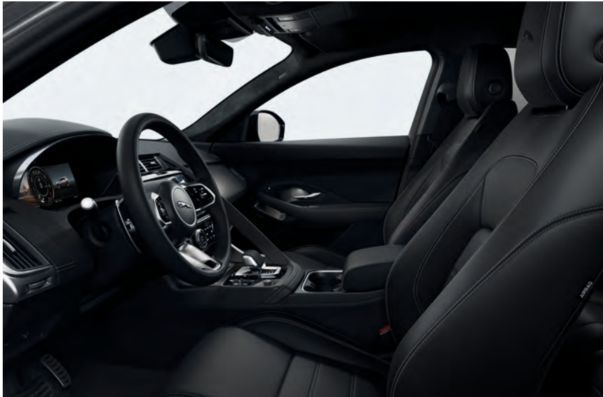
E-PACE R-Dynamic Interior Shown: Ebony Grained Leather Sport Seats