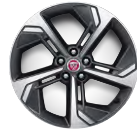
19" 5 SPOKE 'STYLE 5119'