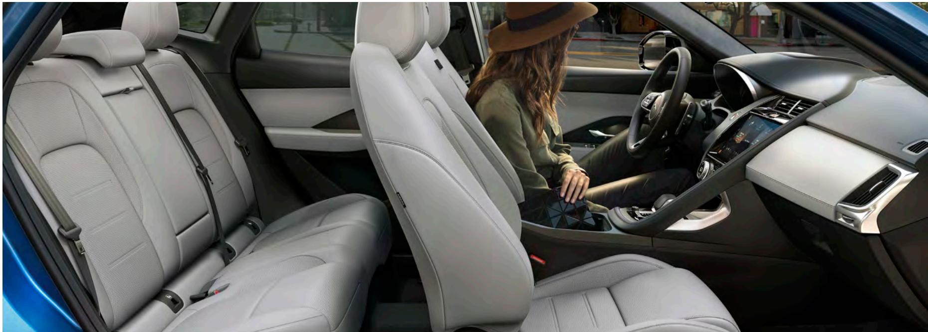
E-PACE R-Dynamic Interior Shown: Cloud Grained Leather Sport Seats