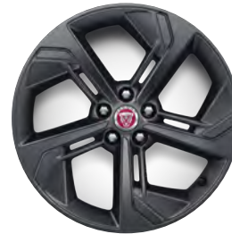
19" 5 SPOKE 'STYLE 5119'