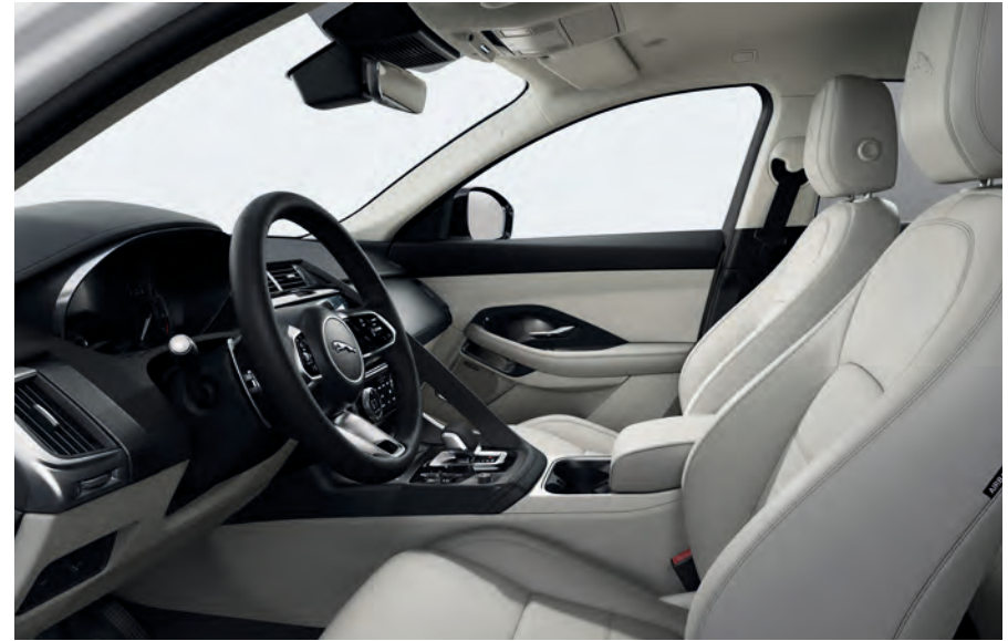
E-PACE R-Dynamic Interior Shown: Cloud Grained Leather Sport Seats