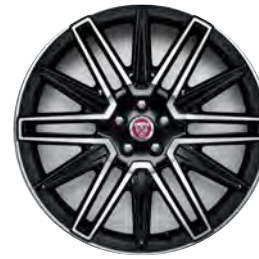
21" 12 SPLIT SPOKE 'STYLE 1078'