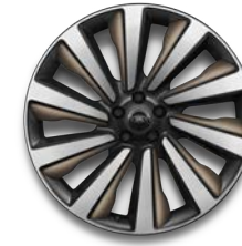
23" Forged, Style 1077 Diamond Turned with Gloss Dark Grey contrast and Corinthian Bronze Satin inserts 1,2