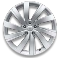
21" Style 5112 Standard on SE

With a variety of styles and finishes for 21"- 22" and all-new 23" wheels to ensure robust proportions and supreme stature.