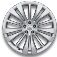
23" Style 1074 1 Standard on First Edition