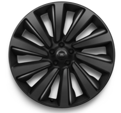
23" Forged, Style 1077 Satin Dark Grey with Satin Black contrast and Narvik Black Gloss inserts 1,3