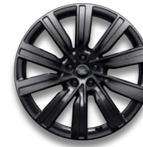
22" Style 1073 Gloss Black