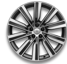
22" Style 1073 Diamond Turned with Gloss Dark Grey contrast Standard on Autobiography