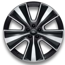
SV Bespoke 22" Style 1072 Diamond Turned with Satin Black contrast