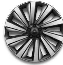
23" Forged, Style 1077 Diamond Turned with Gloss Dark Grey contrast and Bright Atlas Satin inserts 1