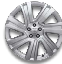
22" Style 7023 Standard on HSE