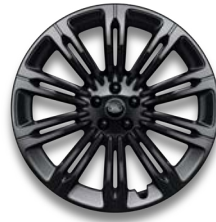
23" Style 1075 Gloss Black 1