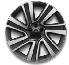
22" Style 7023 Diamond Turned with Gloss Dark Grey contrast Standard on SV