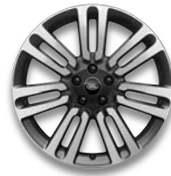
21" Style 7021 Diamond Turned with Gloss Dark Grey contrast