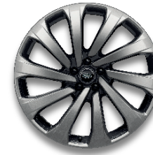
SV Bespoke 23" Style 1079 Silver with Gloss Dark Grey contrast 1