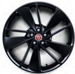
20" 10 SPOKE 'STYLE 1067'