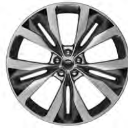
22" 15 SPOKE 'STYLE 1020'