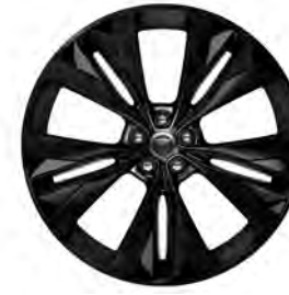
22" 15 SPOKE 'STYLE 1020'