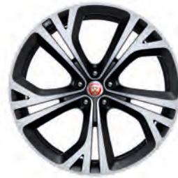
21" 5 SPLIT SPOKE 'STYLE 5080'