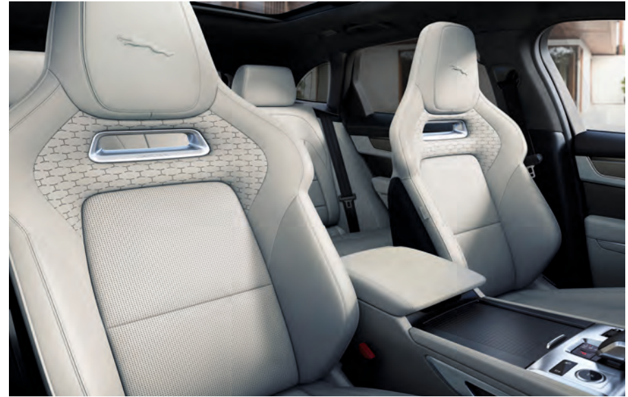
F-PACE R-Dynamic HSE Interior Shown: Light Oyster Windsor Leather Performance Seats