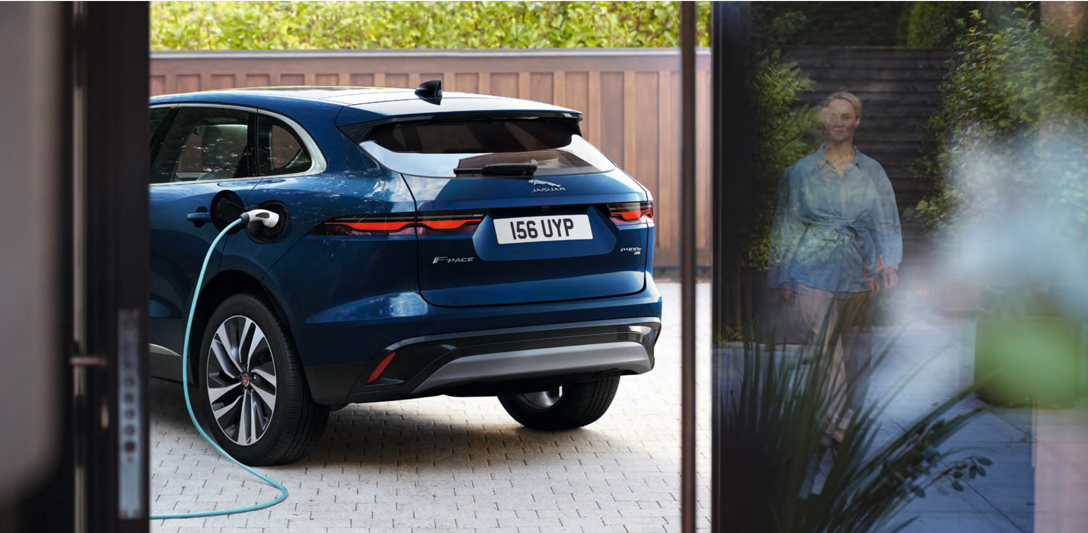
VEHICLE SHOWN: F-PACE P400e (PHEV - Plug-in Hybrid Electric Vehicle) in Portofino Blue with optional features