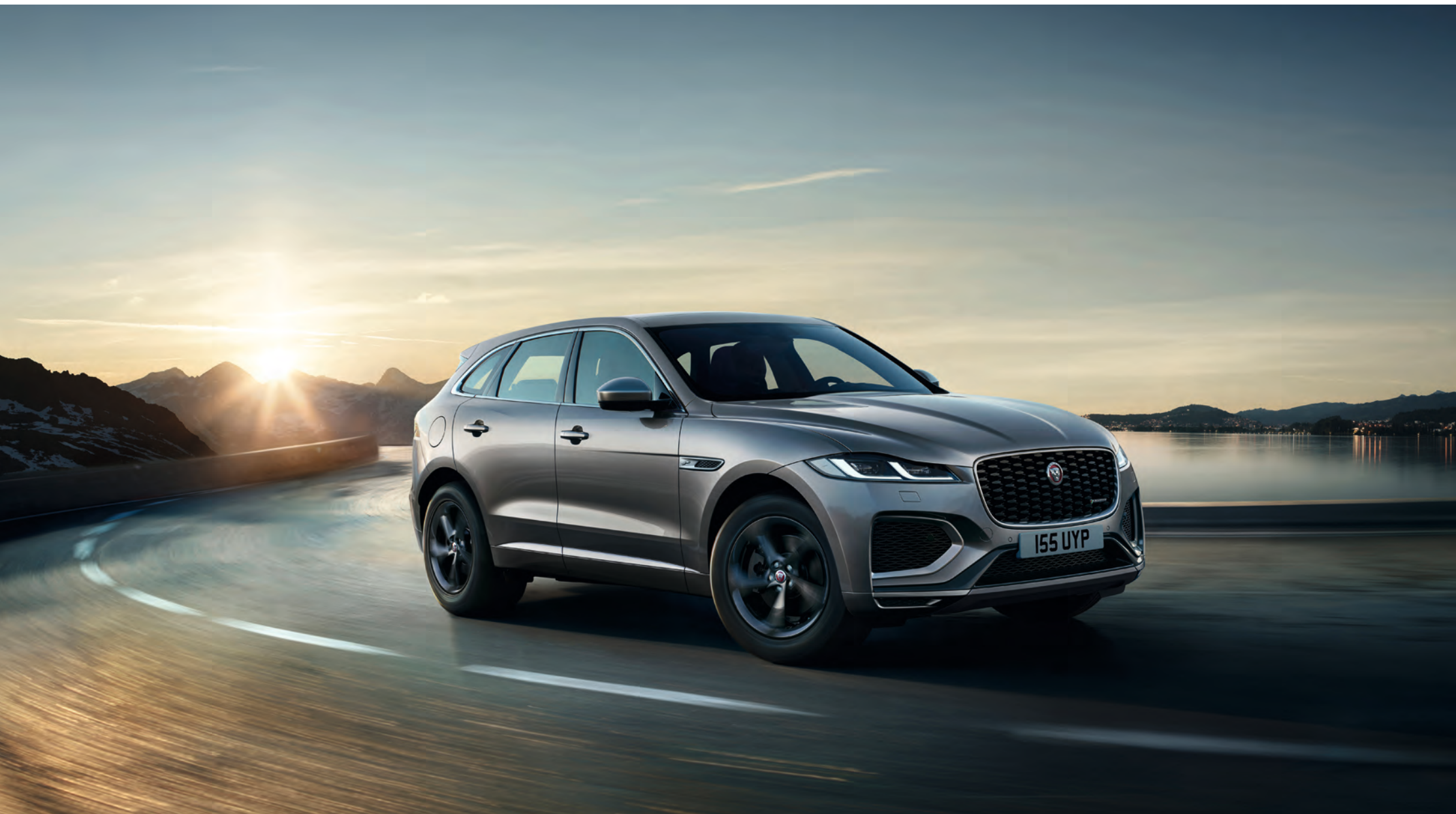
VEHICLE SHOWN: F-PACE in Charente Grey with optional features