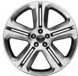
20" 5 SPLIT SPOKE 'STYLE 5036'