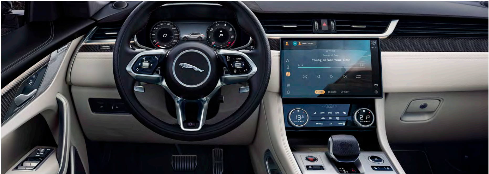
F-PACE SVR Interior Shown: Light Oyster