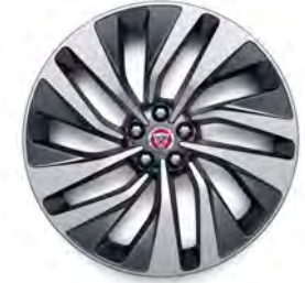
21" 10 SPOKE 'STYLE 1068'