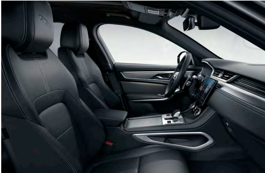
F-PACE R-Dynamic SE Interior Shown: Ebony Grained Leather Sport Seats