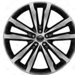
20" 5 SPLIT SPOKE 'STYLE 5031'