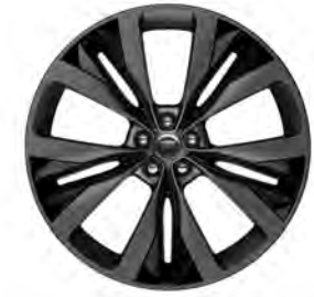
22" 15 SPOKE 'STYLE 1020'