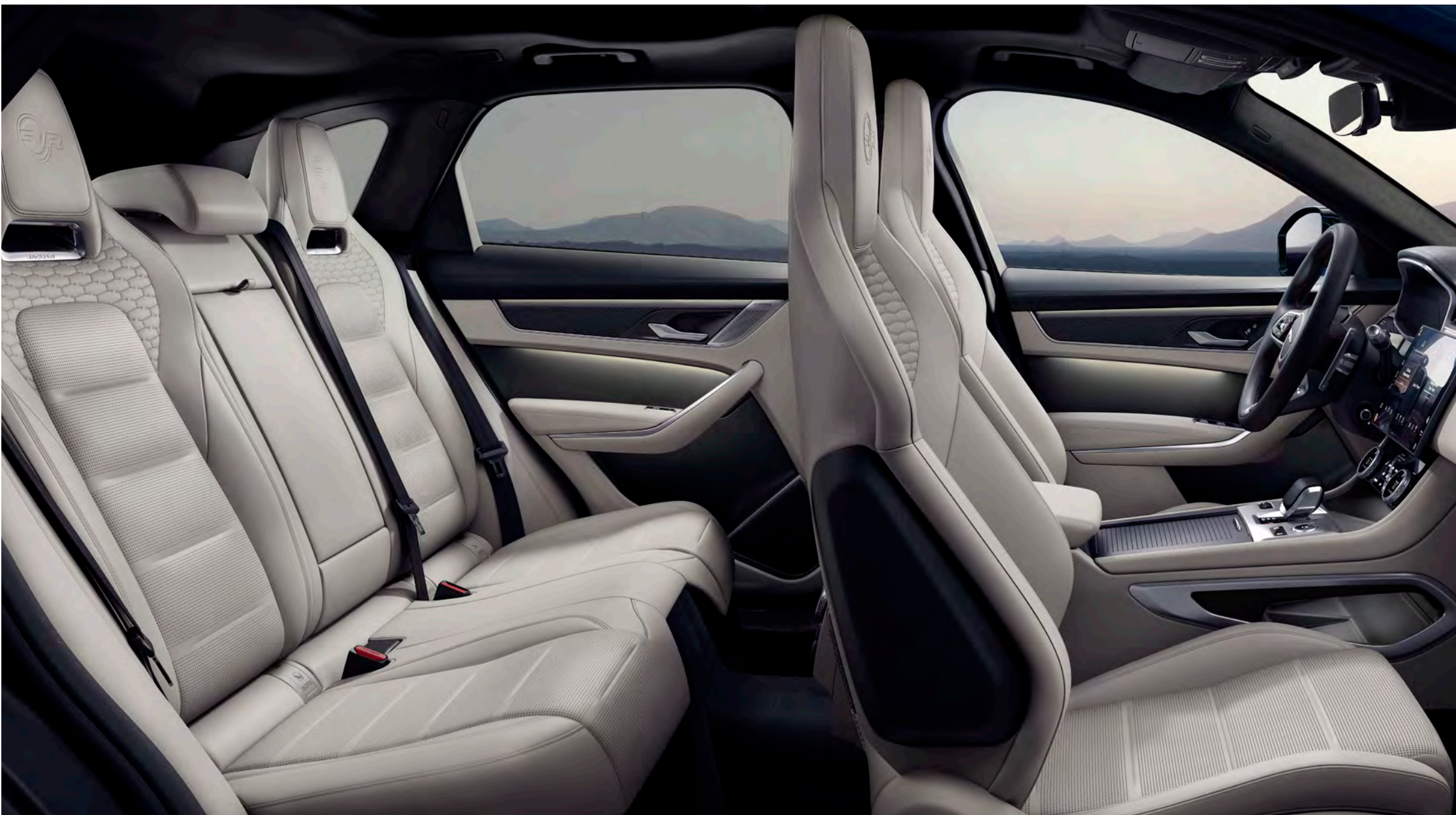
VEHICLE INTERIOR SHOWN: F-PACE SVR Light Oyster Semi-Aniline Leather Performance Seats