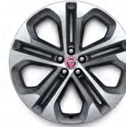
21" 5 SPLIT SPOKE 'STYLE 5104'