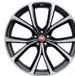
22" 5 SPLIT SPOKE 'STYLE 5081'