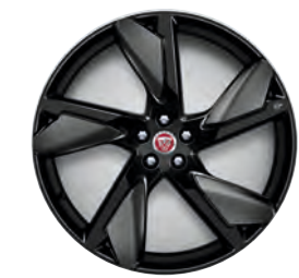
22" 5 SPLIT SPOKE 'STYLE 5117'