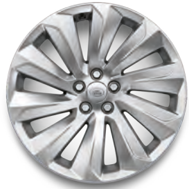
19" 10 SPOKE 'STYLE 1039' SILVER