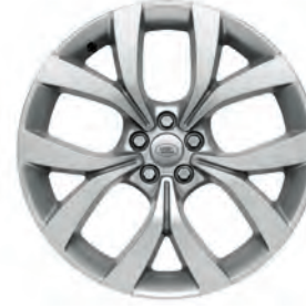
20" 5 SPLIT SPOKE 'STYLE 5076' SILVER