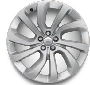
20" 5 SPLIT SPOKE 'STYLE 5089' SILVER