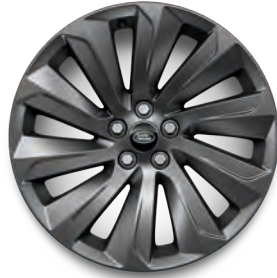
19" 10 SPOKE 'STYLE 1039' SATIN DARK GREY