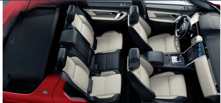
Interior shown: Light Oyster/Ebony Grained leather seats with Light Oyster stitch and Titanium Mesh trim finisher.