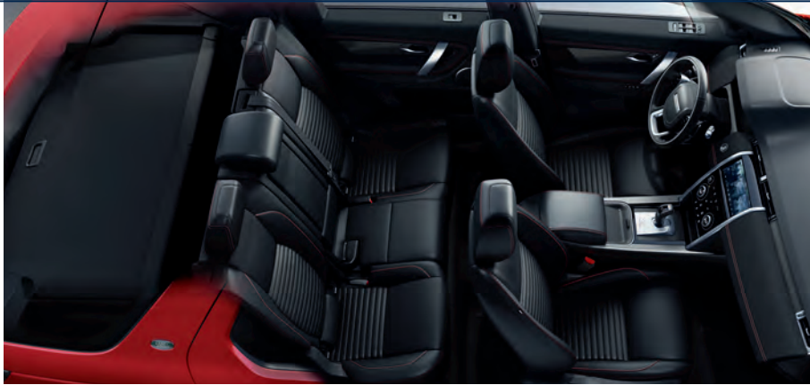
Interior shown: Ebony grained leather seats with Mars Red stitch and Titanium Mesh trim finisher.