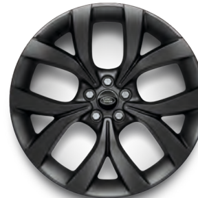
20" 5 SPLIT SPOKE 'STYLE 5076' SATIN DARK GREY