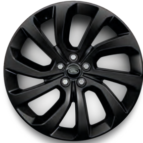
20" 5 SPLIT SPOKE 'STYLE 5089' GLOSS BLACK