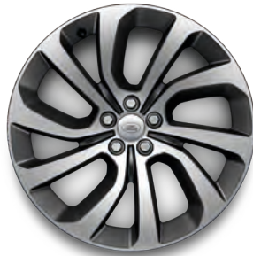
20" 5 SPLIT SPOKE 'STYLE 5089' GLOSS BLACK & CONTRAST DIAMOND TURNED