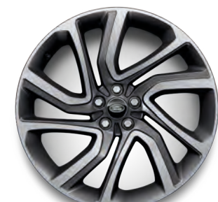
21" 5 SPLIT SPOKE 'STYLE 5090' GLOSS BLACK & CONTRAST DIAMOND TURNED